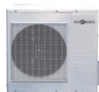
10,8 kW: 3 fazy