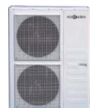
14,1 kW: 3 fazy 17,6 kW: 3 fazy